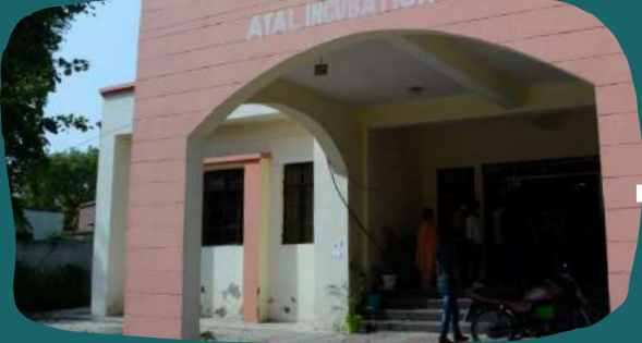
Atal Incubation Hub