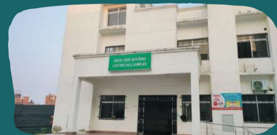
Lecture Hall Complex

Established in 1921, Harcourt Butler Technical University (HBTU), formerly known as Harcourt Butler Technological Institute (HBTI), has been reconstituted to University as per Act No. 11 of 2016 by the government of Uttar Pradesh to be a center of excellence with focus on “Research, Development and Incubation” in all fields. It has been a beacon of knowledge for over a century, playing a pivotal role in shaping the careers of hundreds of engineers, scientists, and technocrats. On academic front, the University is running five schools namely, School of Engineering (SoE); School of Entrepreneurship and Management, School of Chemical Technology (SoCT); School of Basic & Applied Sciences (SoBAS) and School of Humanities and Social Sciences (SoHSS). HBTU stands out for its commitment to research and innovation, promoting a culture where students and faculty collaborate with industries, fostering an environment of practical learning and technological advancement. The university has two vast campuses, the East Campus and West Campus, with state-of-the-art laboratories and other facilities that enable students to excel both, academically and socially. One of the most remarkable aspects of HBTU is its rich alumni network, which includes trailblazers and innovators across various sectors. These accomplished alumni continue to support and inspire current students, further strengthening the university’s legacy.