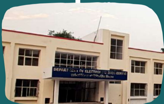
New Building Electronics Engg.