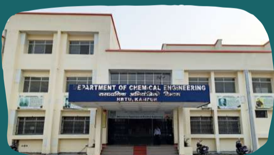
New Building Chemical Engg.